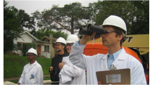
A search crew was sent to a Minnesota Department of Transportation site to search for missing workers.

The bill also allocates $200 million in federal stimulus funding to weatherize low-income homes and public buildings and to invest in other renewable energy and energy efficiency programs, making it a big win for the environment and for people struggling to pay utilities bills. This is 13 times more funding for state weatherization programs than they typically receive in a year. Weatherization can reduce the energy required to heat and cool a home by 20 to 30 percent annually, dramatically decreasing a household's costs, as well as reducing its contribution to climate change.