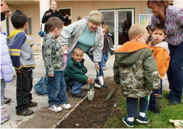
Planting bulbs at Sun Valley Center.

Sharing the new location with agencies such as the Family Resource Center and the Project Head Start program provides new opportunities for multi-generational activities. Residents of all ages are encouraged to take part in daily Bingo, senior center chess wizards challenged local teens to join them for games during the summer months, Retired and Senior Volunteer Program members read to students in the early childhood education program located there, and in the early fall, Head Start students and seniors worked together to plant hundreds of spring bulbs donated by a local Home Depot.