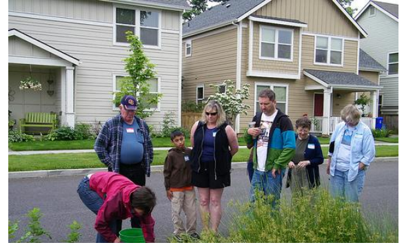
Rain garden workshop.