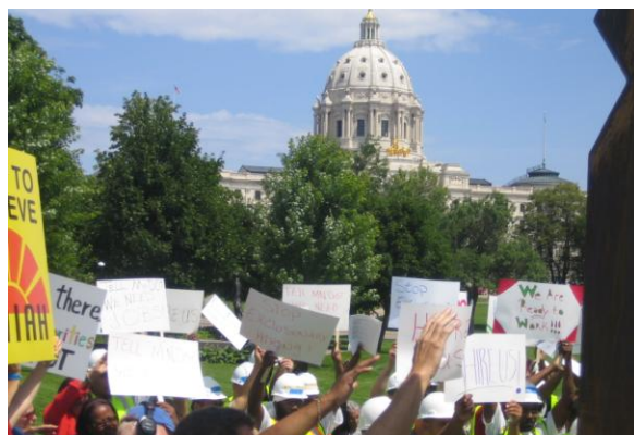
Rally at the State Capitol.

Since late 2008, the coalition has engaged thousands of people through town hall meetings as a vehicle to educate community members and start harnessing community voices to influence decision makers to support green jobs and hiring equity. The coalition also sponsored rallies, community gatherings and hearings at the State Capitol.