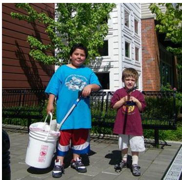
Working on the beautification squad.