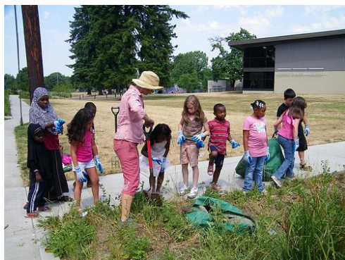
New Columbia kids learn about rain gardens.