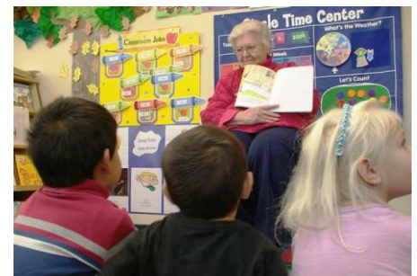
Intergenerational story time at Sun Valley.