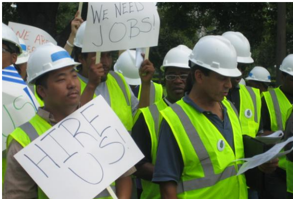
At the "missing persons" rally. A "missing persons report" was filed with the MN Dept of Transportation to alert them that hiring goals for women and people of color have been missed for 18 consecutive years.

A coalition of more than 70 community organizations in the Twin Cities area of Minnesota is working to ensure that public investments in infrastructure and renewable energy help lift people out of poverty, reduce racial disparities and contribute to healthier communities for everyone . HIRE Minnesota is a campaign to create a new green economy -- and to do it in a way that generates new jobs, reduces global warming pollution, and builds opportunities for low-income people and people of color.