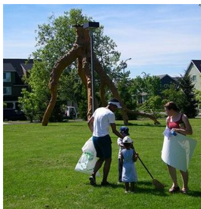
Helping keep McCoy Park clean.