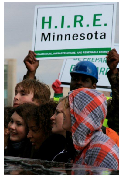
Rally at the State Capitol.