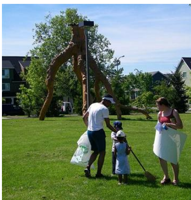
Helping keep McCoy Park clean.