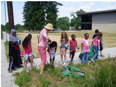
New Columbia kids learn about rain gardens.